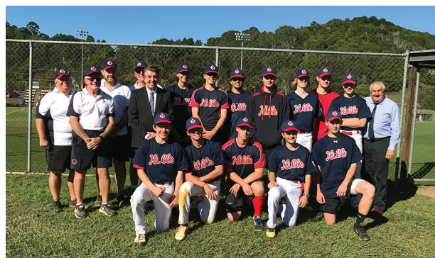
The Hills Senior League U17 team

I want to congratulate the Hills Junior Baseball Association on their achievements locally, nationally and internationally; and wish both the Little League and Junior League teams the best of luck in the World Series!