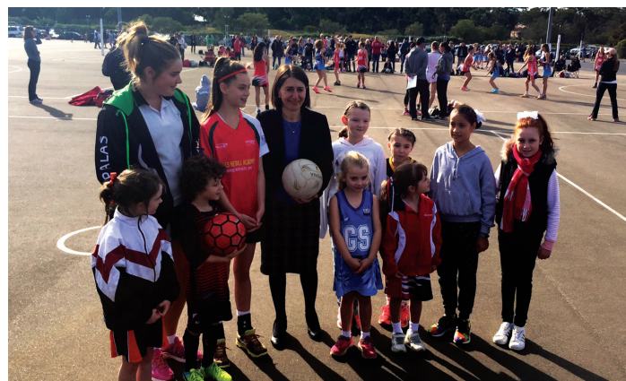
Premier of NSW Gladys Berejiklian visited the Baulkham Hills Netball Association to spread the word to Parents, Players and Coaches about the fantastic Active Kids Rebate.

Thousands of school children across New South Wales are set to benefit from a new $100 rebate per child for sporting and fitness related costs.